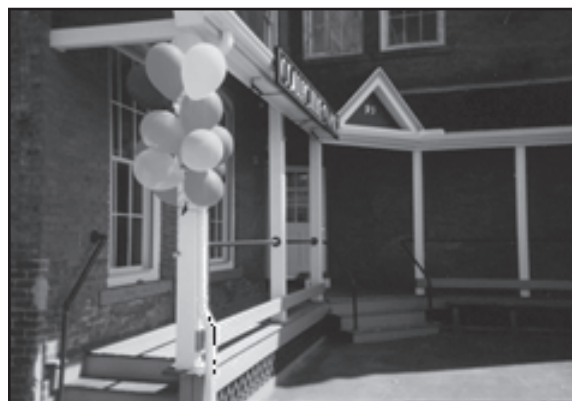
Storefront in Florence, MA

Over the years, Collective Copies has expanded and improved its operation. The business has changed locations from a second floor space to a ground floor space to its own larger storefront in Amherst, then opened a second operation in Florence in April