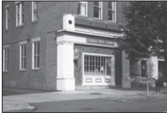
Storefront in Amherst, MA

Now that is co-operation among cooperatives!