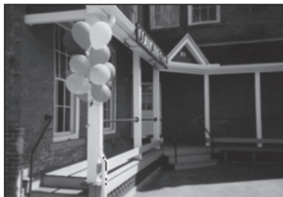
Storefront in Florence, MA

Over the years, Collective Copies has expanded and improved its operation. The business has changed locations from a second floor space to a ground floor space to its own larger storefront in Amherst, then opened a second operation in Florence in April