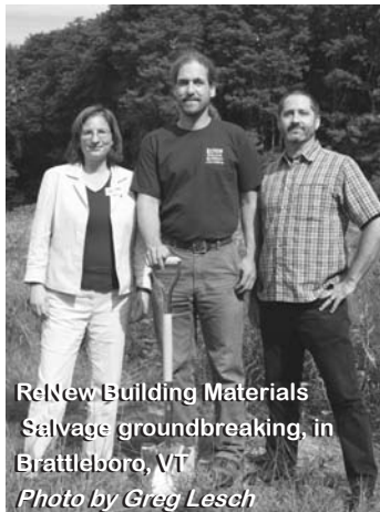
ReNew Building Materials Salvage groundbreaking, in Brattleboro, VT

community nonprofit providing services to at-risk youth in Greenfield, MA, to help meet cash flow needs; $30,000 to Collective Copies , a worker cooperative in Amherst, Florence, and Belchertown, MA, for equipment purchases; $252,000 to the Intervale Center in Burlington, VT, to refinance their composting equipment; $15,000 to Plainfield Food Cooperative in Plainfield, VT, for cash flow management; $75,000 to HAP ,